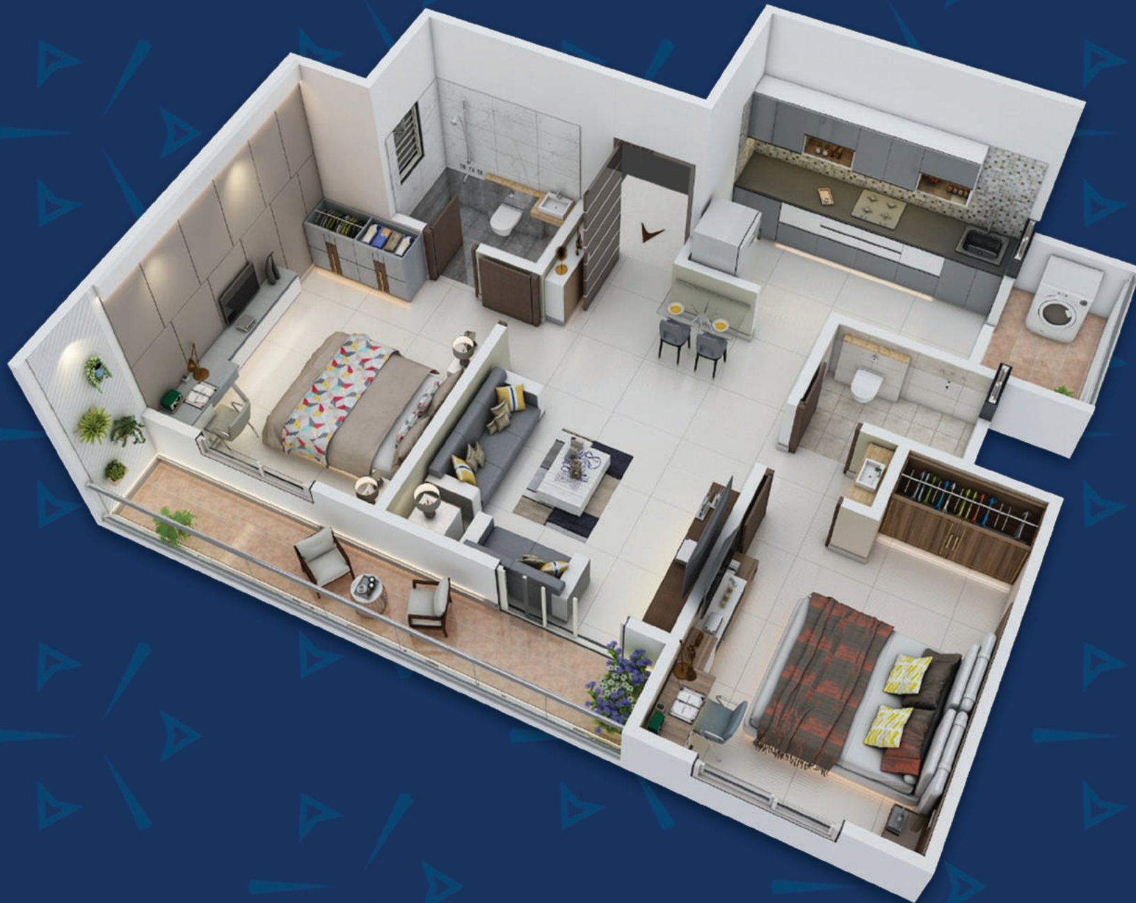
2 BHK Apartment Layout