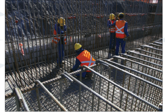
Earthquake Resistant Structure