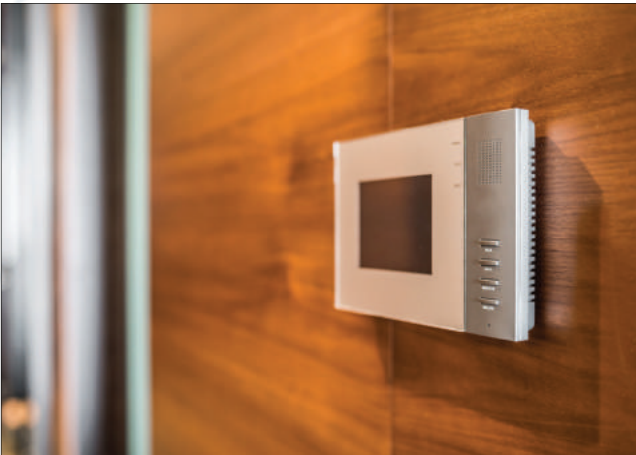
Video Door Phone