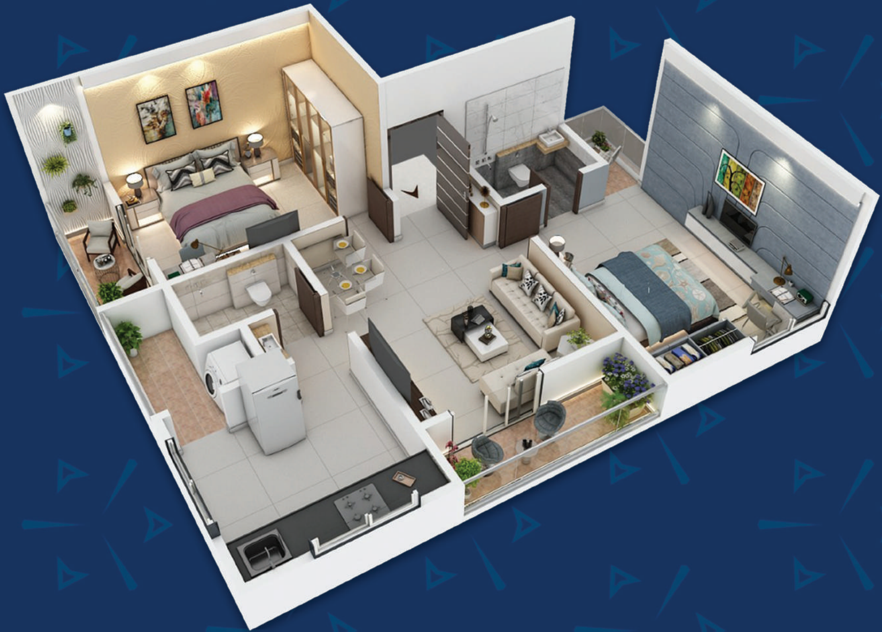
2 BHK Apartment Layout