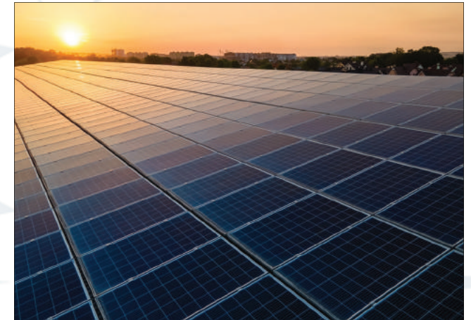
Solar System Common Area